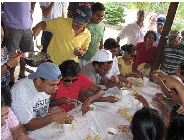
Below - Co-winners of the phuchka eating contest sharing a moment with the most glorious trophy.