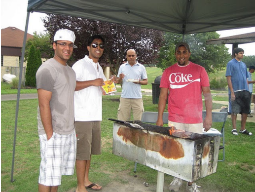
Above - The Grill masters.

The Annual BCS Picnic was held this year on August 1st at Laurel Acres Park in Mount Laurel. Although rain was in the forecast, we were spared the rain, and many people came out to enjoy good food and fun games, including the first annual phuchka eating contest. Here are some pictures from the event.