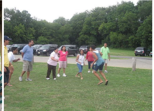
Above - A friendly game of Kabaddi.