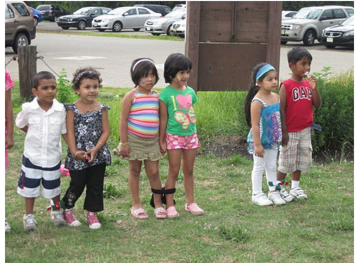
Above - Kids getting ready for the three legged race.